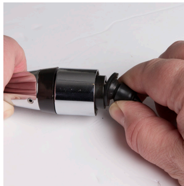
4. Remove the old membrane