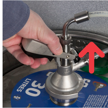
1. Disconnect Keg