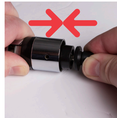
6. Install a new membrane