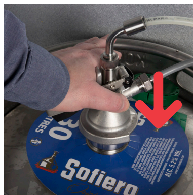
9. Connect the keg