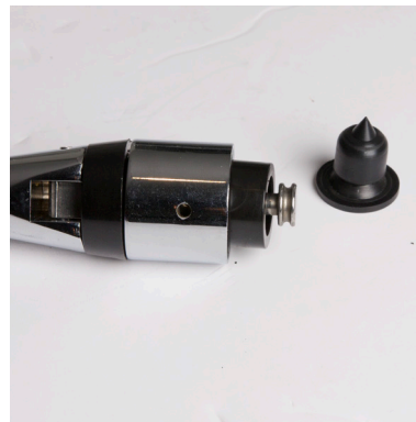
5. Old membrane removed