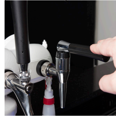
2. Open the tap(s) to release pressure in the system.