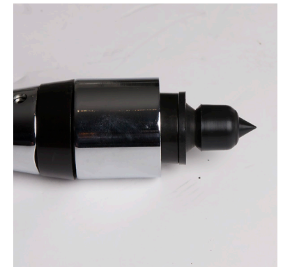
7. Make sure the new membrane is securely in place