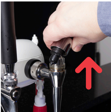
...and lift it out from the tap